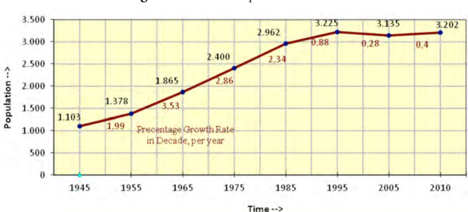
Figure 3. Albania: Population Growth

positive growth rate until 1990 (fig. 3) influenced by many factors, among which as the most important are classified: First, the positive rate of natural population growth. During the communist regime the natural growth was the only factor that influenced the changes in population number. The number of birth for a woman has been very high until 1960 (in average seven births per woman<sup>3</sup>). This number decreased after 1960's and in 1980 every woman in average gave birth to 3-4 children. Although Albanian population is defined as very fertile there were many other factors that influenced the high number of births in the period 1945-1990 such as: the high number of marriages in young age (for women was 20 years and for men was 26 years); the Albanian tradition of having many children; the improvement of hygienic conditions and of mother and children care; the low number of divorces etc. The low number of divorces it was not strongly connected with the happy marriages. In the communist regime it was very difficult to divorce. The propaganda in that period was very negative for the divorced people. Many of them would lose their job, would be no able to have a good career in the future and for the women would be more and more difficult.